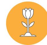
GARDEN & HOME Solutions