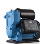
VSD Pump Range