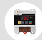
Receiver installed at your pump