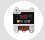
Receiver installed at your pump